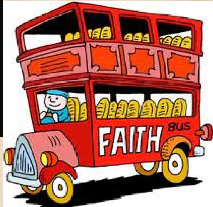
The FAITH bus - let God take you places